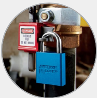
Safety & Wellness